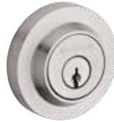
Contemporary Round (CRD)