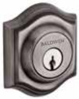
Traditional Arch (TAD)