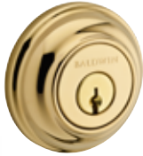
Traditional Round (TRD)