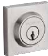
Contemporary Square (CSD)