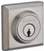
Traditional Square (TSD)