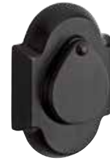
Rustic Arch (RAD)