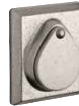
Rustic Square (RSD)