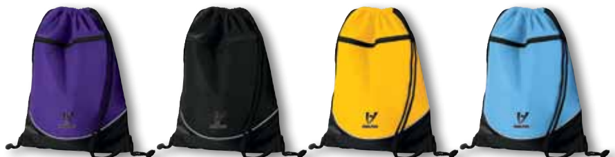
PURPLE/BLK/WHT BLACK/WHITE GOLD/BLK/WHT COL BLUE/BLK/WHT