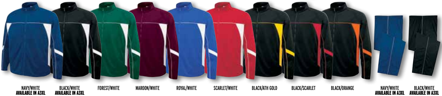
NAVY/WHITE AVAILABLE IN A3XL