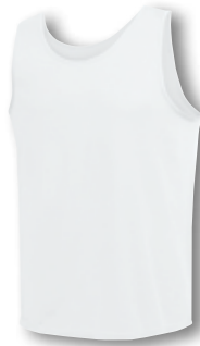
WHITE AVAILABLE IN TOP ONLY