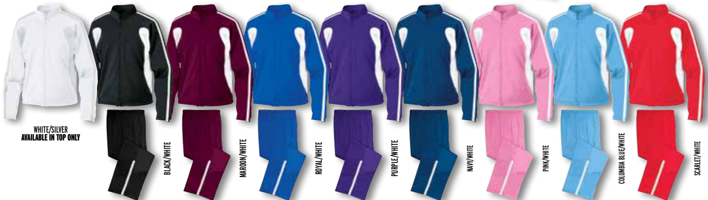
WHITE/SILVER AVAILABLE IN TOP ONLY