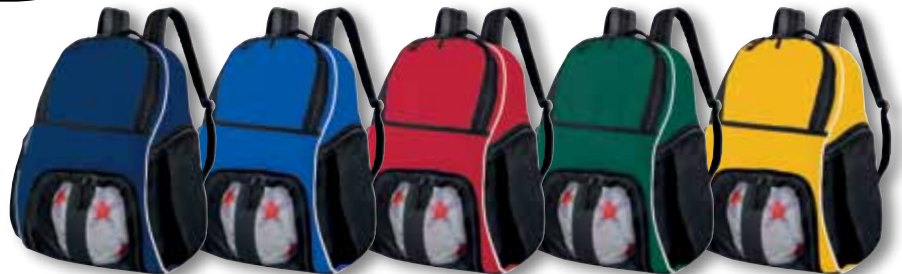
NAVY/BLACK/WHITE ROYAL/BLACK/WHITE SCARLET/BLACK/WHITE FOREST/BLACK/WHITE ATH GOLD/BLACK/WHITE