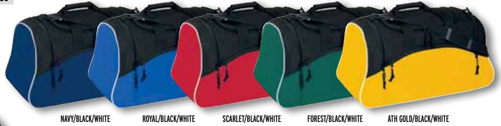
NAVY/BLACK/WHITE ROYAL/BLACK/WHITE SCARLET/BLACK/WHITE FOREST/BLACK/WHITE ATH GOLD/BLACK/WHITE