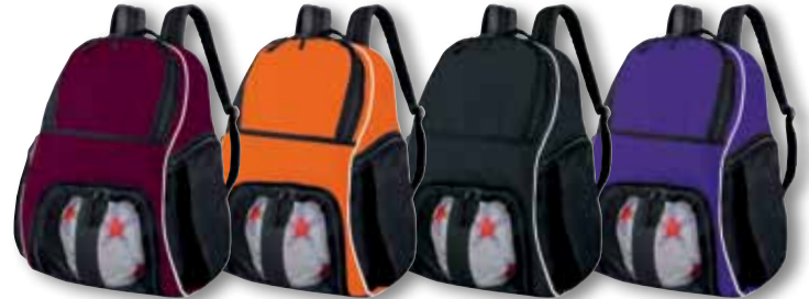
MAROON/BLACK/WHITE ORANGE/BLACK/WHITE BLACK/WHITE PURPLE/BLACK/WHITE