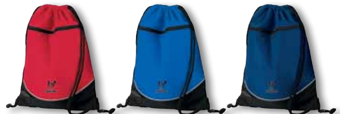
SCARLET/BLK/WHT ROYAL/BLK/WHT NAVY/BLK/WHT