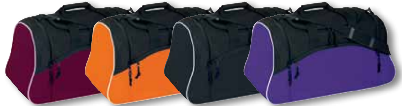
MAROON/BLACK/WHITE ORANGE/BLACK/WHITE BLACK/WHITE PURPLE/BLACK/WHITE