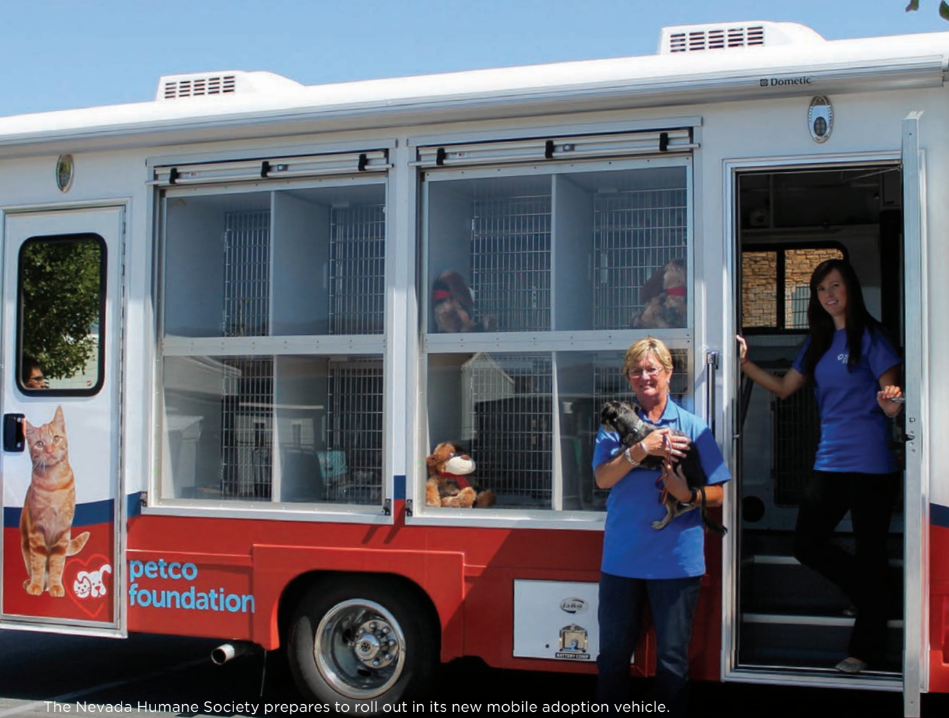
The Nevada Humane Society prepares to roll out in its new mobile adoption vehicle.