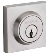
Contemporary Square (CSD)