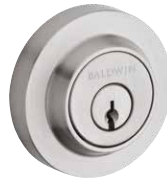
Contemporary Round (CRD)