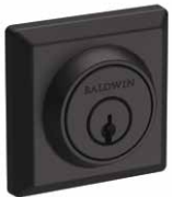
Traditional Square (TSD)