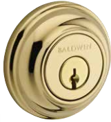
Traditional Round (TRD)