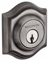
Traditional Arch (TAD)