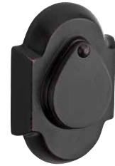
Rustic Arch (RAD)