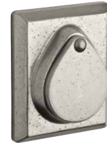
Rustic Square (RSD)