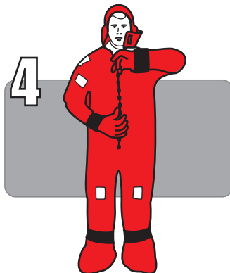
4 INSERT OTHER ARM AND CLOSE ZIPPER AND FACE FLAP. ADJUST WRIST AND ANKLE BANDS TO FIT