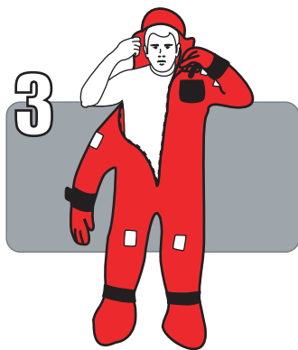
3 INSERT ARM INTO SUIT AND ADJUST HOOD OVER HEAD