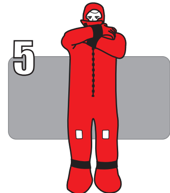
5 ENTER WATER FEET FIRST

IMPORTANT: The inherent buoyancy of an immersion suit may prevent escape from enclosed spaces. it is recommended that the suit be donned for use on a weather deck and not in the vessel's cabins.