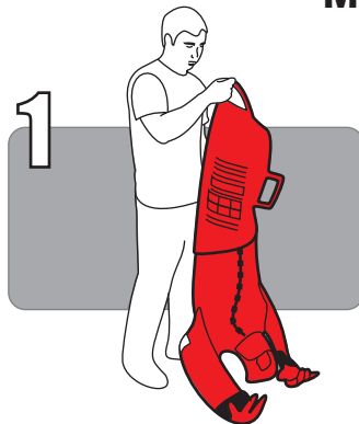
1 REMOVE SUIT FROM BAG