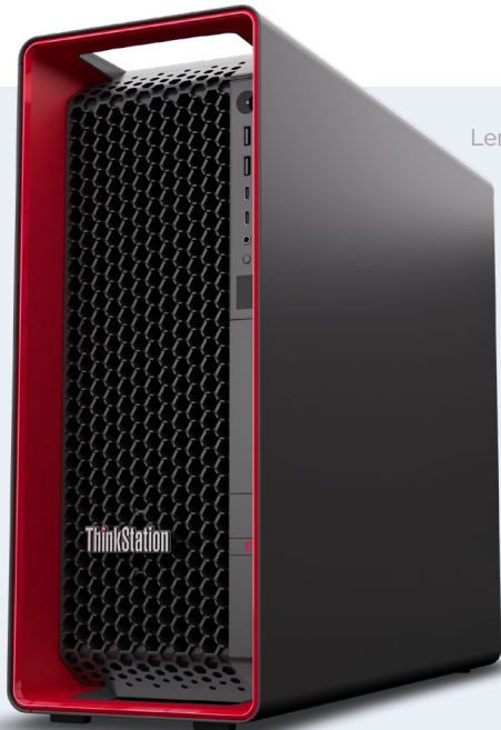
Lenovo ThinkStation® P8 Workstation

With a hybrid approach, data scientists can quickly iterate AI models, reduce latency, keep sensitive data local, and implement AI insights closer to users and data sources.