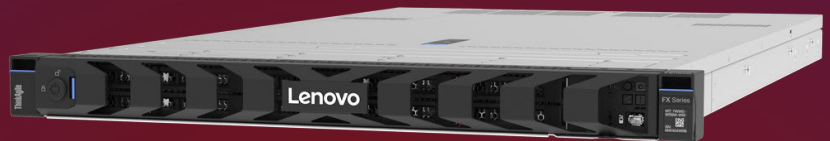
Lenovo ThinkAgile™ FX Series