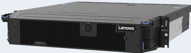
Lenovo ThinkEdge™ SE455i V3 Server