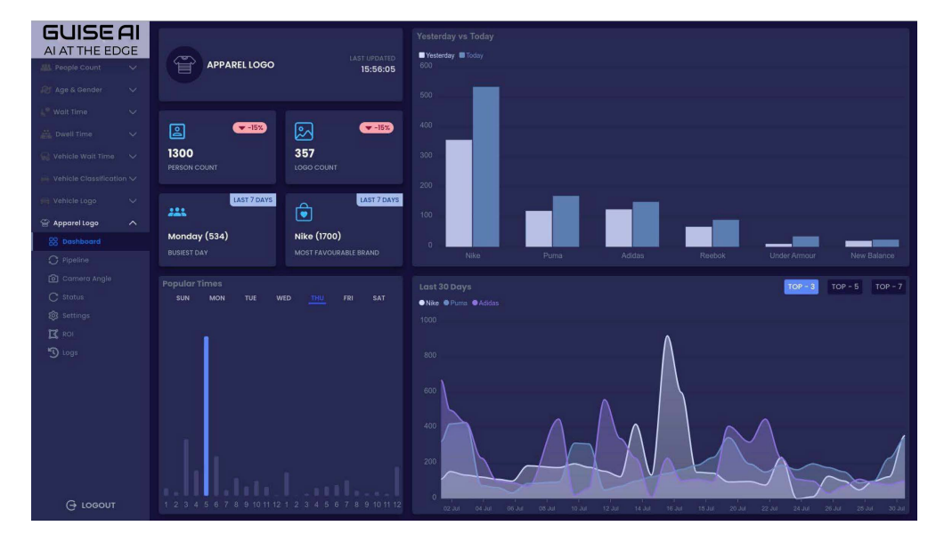
Retail - Apparel Logo Detection