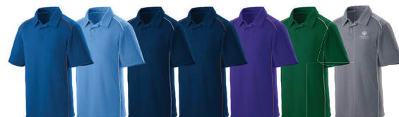
ROYAL/ ORANGE 284 COLUMBIA BLUE/ WHITE 293 NAVY/ WHITE 301 NAVY/ ORANGE 306 PURPLE/ GOLD 495 DARK GREEN/ WHITE 438 GRAPHITE/ WHITE R04