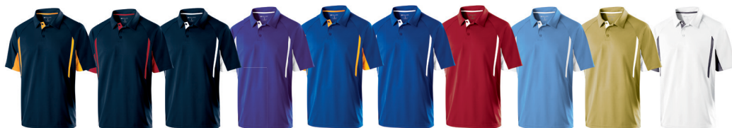
NAVY/ LIGHT GOLD S28