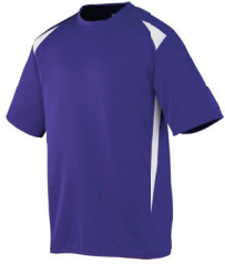
CREW 1050 | 1051 PG.240