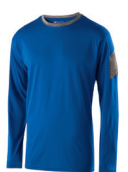
222527 Electron Shirt L/S pg. 230