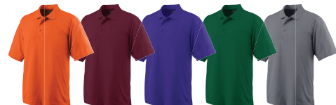
ORANGE 029 MAROON 045 PURPLE 050 DARK GREEN 035 GRAPHITE 059