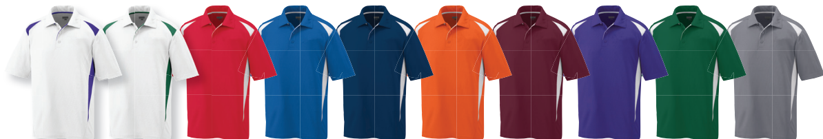
WHITE/ PURPLE 231