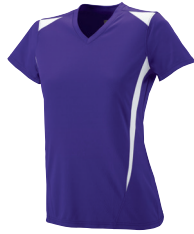
LADIES JERSEY 1055 | 1056 PG.240