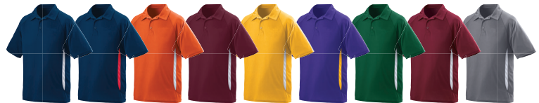
NAVY/ WHITE 301