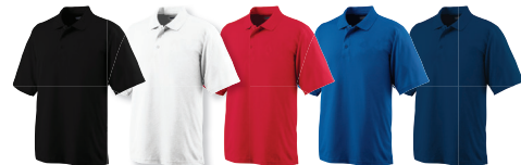
BLACK 080 WHITE 005 RED 040 ROYAL 060 NAVY 065