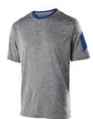
222526 Electron Shirt S/S pg. 247