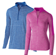
222542 | 222742 Electrify 1/2 Zip Pullover pg. 224