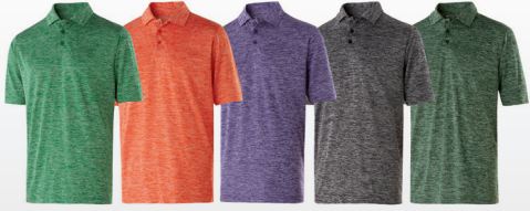
KELLY HEATHER U10 ORANGE HEATHER U78 PURPLE HEATHER U86 BLACK HEATHER U36 FOREST HEATHER U41