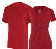
2950 | 2951 | 2952 Intensify Black Heather Training Tee pg. 249