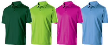
FOREST 038 LIME 096 POWER PINK 809 UNIVERSITY BLUE S48