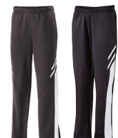
229569 | 229669 | 229769 Flux Straight Leg Pant pg. 424