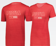
222555 | 222755 Striated Shirt Short Sleeve pg. 246