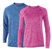
222524 | 222724 Electrify 2.0 Shirt L/S pg. 233