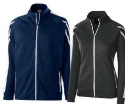
229568 | 229668 | 229768 Flux Jacket pg. 370