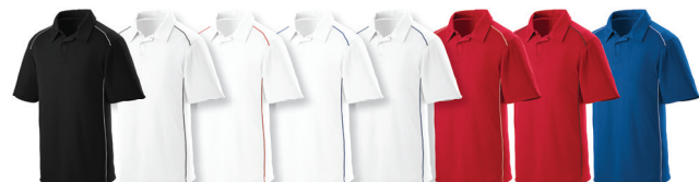
BLACK/ WHITE 420 WHITE/ BLACK 226 WHITE/ RED 225 WHITE/ ROYAL 220 WHITE/ NAVY 221 RED/ WHITE 400 RED/ BLACK 407 ROYAL/ WHITE 280