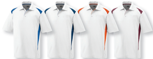
WHITE/ ROYAL 220