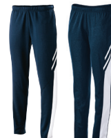
229570 | 229670 | 229770 Flux Tapered Leg Pant pg. 424