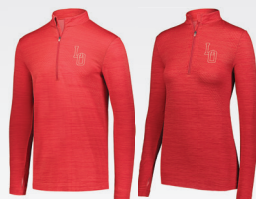
222557 | 222757 Striated 1/2 Zip Pullover pg. 223