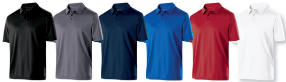
BLACK 080 GRAPHITE 059 NAVY 065 ROYAL 060 SCARLET 083 WHITE 005