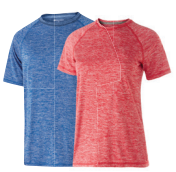
222522 | 222722 Electrify 2.0 Shirt S/S pg. 248