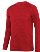
2953 Intensify Black Heather Long Sleeve Tee pg. 234