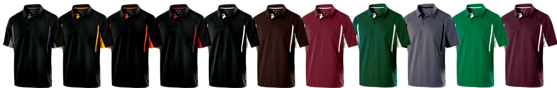
BLACK/ GRAPHITE R17