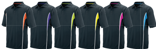
SLATE/ ORANGE/ WHITE V11 SLATE/ PURPLE/ WHITE V15 SLATE/ LIME/ WHITE V10 SLATE/ POWER YELLOW/ WHITE V14 SLATE/ POWER PINK/ WHITE V13 SLATE/ POWER BLUE/ WHITE V12