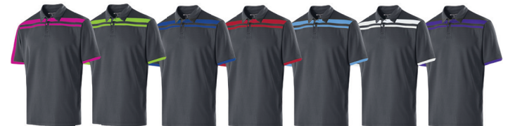
CARBON/POWER PINK F50