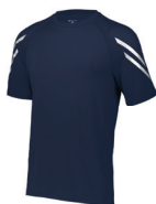
222506 | 222606 Flux Shirt Short Sleeve pg. 241