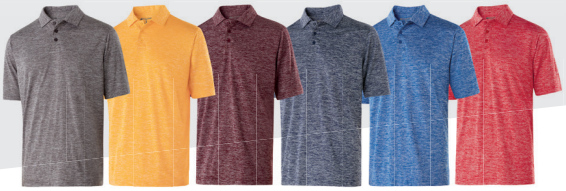
GRAPHITE HEATHER R13 LIGHT GOLD HEATHER U63 MAROON HEATHER T09 NAVY HEATHER U22 ROYAL HEATHER U55 SCARLET HEATHER T20