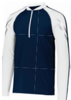
222502 Flux 1/2 Zip Pullover pg. 403