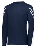
222507 | 222607 Flux Shirt Long Sleeve pg. 229