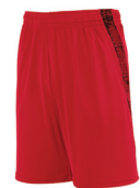
2960 | 2961 Intensify Black Heather Training Short pg. 277