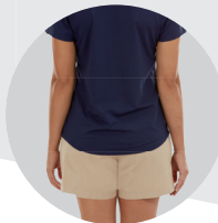
CONTOURED BOTTOM ON LADIES