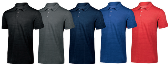
BLACK 080 GRAPHITE 059 NAVY 065 ROYAL 060 SCARLET 083