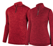
2955 | 2957 Intensify Black Heather 1/4 Zip Pullover pg. 226