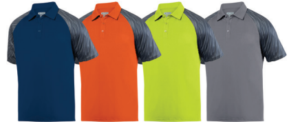
NAVY/ SLATE V23