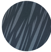
SUBLIMATED BREAKER PRINT