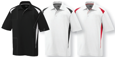
BLACK/ WHITE 420