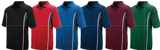
BLACK/ SLATE/ WHITE V01 RED/ SLATE/ WHITE V05 ROYAL/ SLATE/ WHITE V06 NAVY/ SLATE/ WHITE V04 MAROON/ SLATE/ WHITE V03 DARK GREEN/ SLATE/ WHITE V02