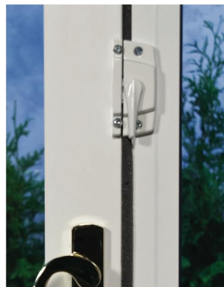
Latch Lock Assembly

See reverse side for part numbers and dimensions.