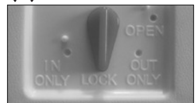
Red Adjustment Dial

Adjustable flap operation - Using the Red Adjustment Dial (D) located on door's lower outer frame (A), adjust to match desired operation as indicated on door. In only, out only, open and lock. (See picture detail at right)