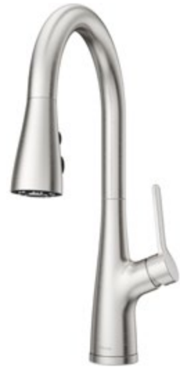
Pull-Down Kitchen Faucet