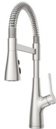
Culinary Kitchen Faucet