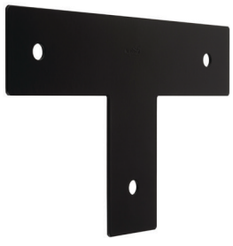
T-Strap 3" x 13 <sup>1</sup>/<sub>2</sub>" x 8 <sup>1</sup>/<sub>4</sub>" 5" x 17 <sup>1</sup>/<sub>2</sub>" x 11 <sup>1</sup>/<sub>4</sub>"