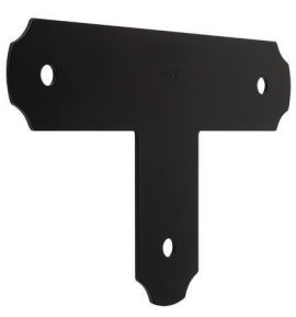
T-Strap 3" x 13 <sup>1</sup>/<sub>2</sub>" x 8 <sup>1</sup>/<sub>4</sub>" 5" x 17 <sup>1</sup>/<sub>2</sub>" x 11 <sup>1</sup>/<sub>4</sub>"