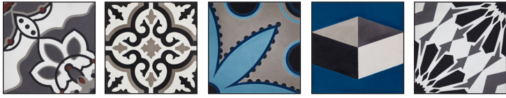
Lacy Liria Negro Riodan Rowallan Star Black/Grey