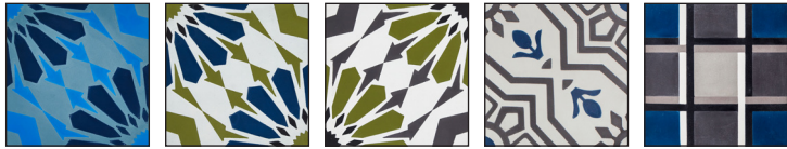
Star Blue/Blue Star Olive/Blue Star Olive/Grey Talavera Tantallon