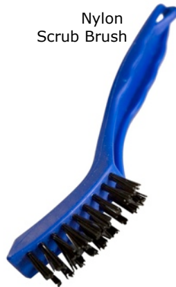
Nylon Scrub Brush