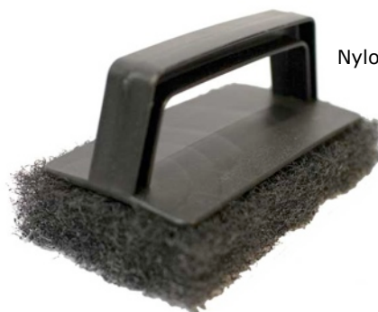
Nylon Scrub Pad