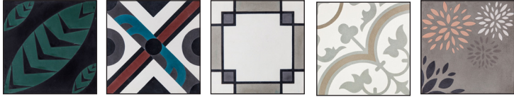
Arwen Astoria Blair Chevrny Blanc Diadem