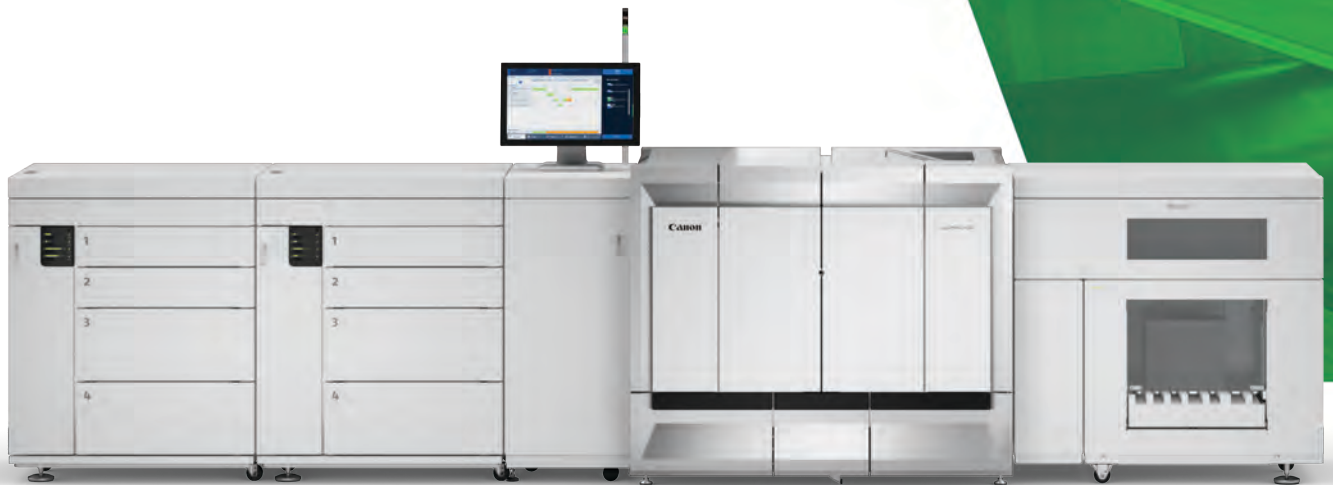
varioPRINT 6330 TITAN shown with optional accessories.