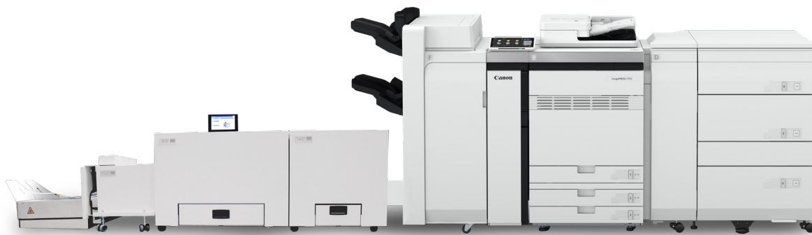
imagePRESS V900 shown with optional accessories.

To view detailed specifications and requirements, please consult the Customer Expectations Document.