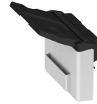
Long Sheet Catch Tray-D1