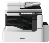
Inner 2Way Tray-M1