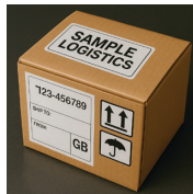
Transport and Logistics