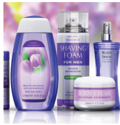
Health and Personal Care