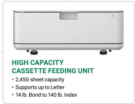
HIGH CAPACITY CASSETTE FEEDING UNIT