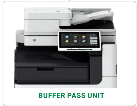
BUFFER PASS UNIT