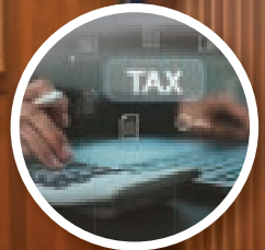
DATA CAPTURE AND RETRIEVAL