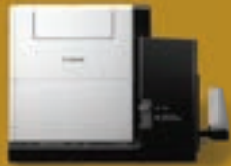
2" Dye Card & Badge printers

Produce ID cards on-demand with quality and security in mind.