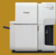
4" Dye Card & Badge printers