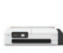
Large Format Printer