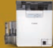
Thermal Transfer Card & Badge printers