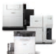
Card & Badge Printers