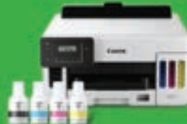
Single Function Ink Tank Printer