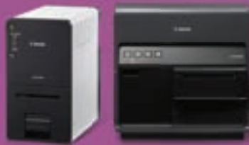
Dye and Pigment version in 2" and 4"

Create labels that meet your specific needs.