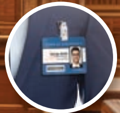
ON-DEMAND ID PRINTING