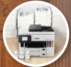
COST EFFECTIVE PRINTING