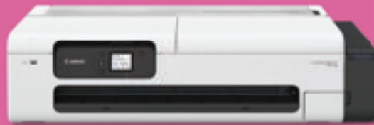
Large Format, Multifunction Ink Tank Printer