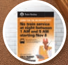
CREATE LARGE VISUAL APPEALING CONTENT