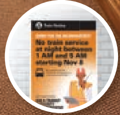
CREATE LARGE VISUAL APPEALING CONTENT