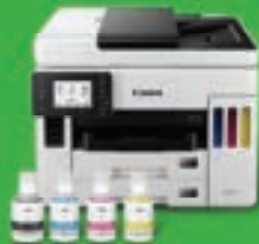
Multi-Function Ink Tank Printer

Cost-effective, high-capacity ink tank printers that support a wide range of use cases.