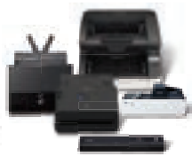
Document & Check Scanners