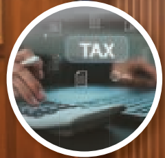
DATA CAPTURE AND RETRIEVAL