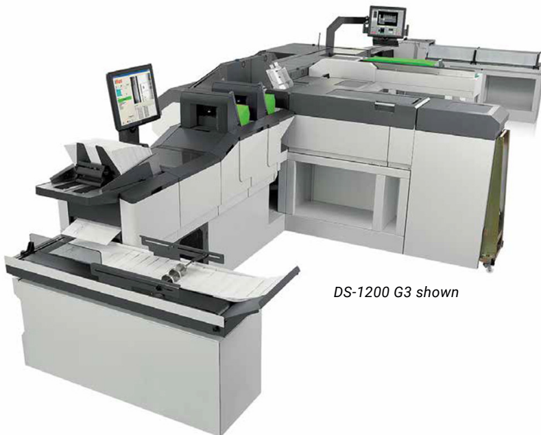
DS-1200 G3 shown

The AIMS application is browser-based and its dashboards are scalable, making the number of real-time views unlimited. Dashboard views can be configured to show the performance of individual inserters and jobs, or combined into a view of the complete mail center. AIMS is the perfect choice for mail center management while multiple closed-loop jobs run in the background.