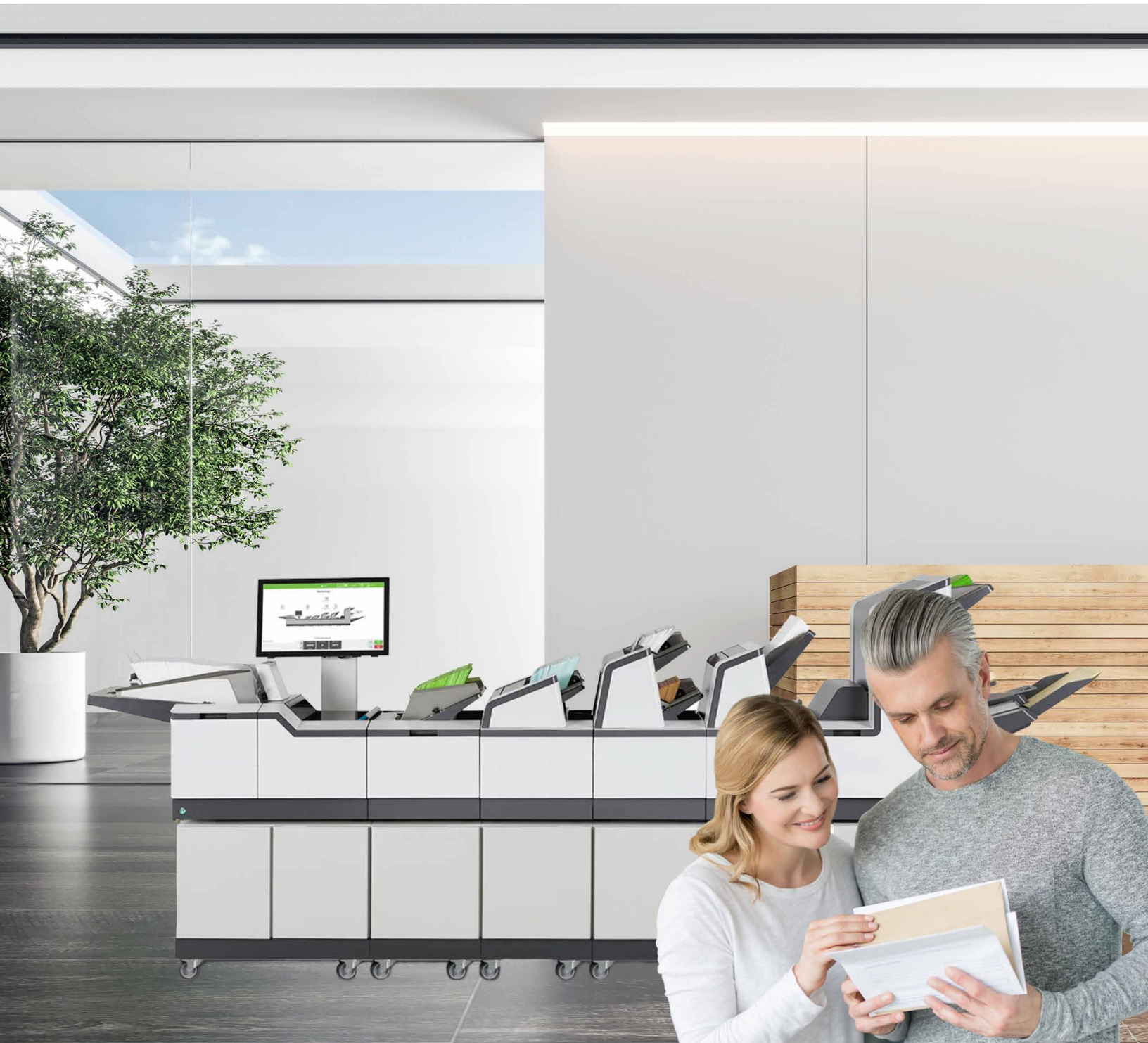
DS-180i Folder Inserter