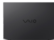
All Black Edition