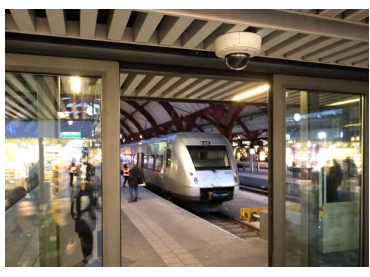
Network cameras for transportation hubs (Sweden)