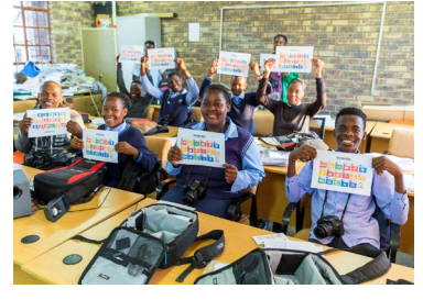
Young People Programme conducted by Canon Europe