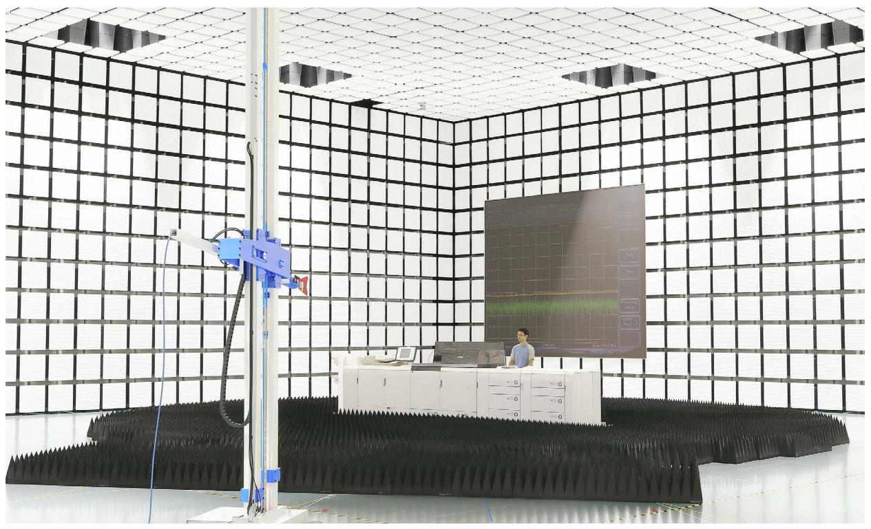
One of the largest semi-anechoic chambers in Japan where tests on large products can be carried out (→P116)