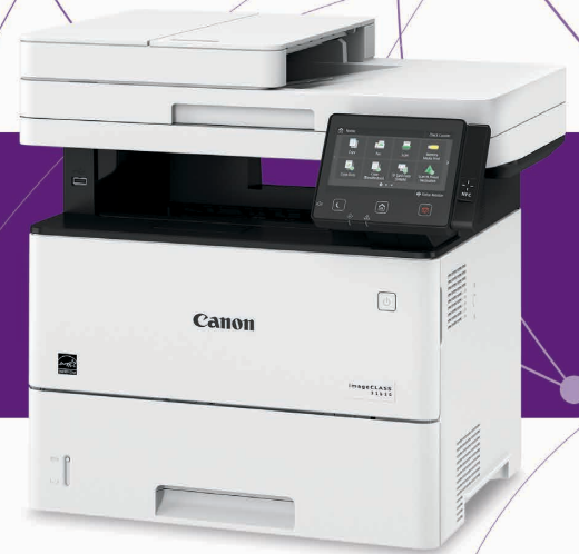
imageCLASS D1650 shown

Designed for small to mid-size workgroups, the imageCLASS D1650/D1620 balances speedy performance, minimal maintenance, and the ability to expand paper capacity for busy groups. A 5" color touchscreen delivers an intuitive user experience and can be customized by a device administrator to simplify many daily tasks. A legal-sized platen glass accommodates diverse scanning and copying needs.