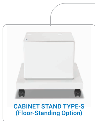
CABINET STAND TYPE-S (Floor-Standing Option)

Canon Extended Service Plans offer coverage beyond the standard one-year limited warranty 6 up to four years.