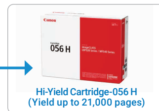
Hi-Yield Cartridge-056 H (Yield up to 21,000 pages)

Use of Canon GENUINE toner cartridges helps provide longer equipment life, high yields, reliable performance, high-quality output, and minimal jamming or issues.