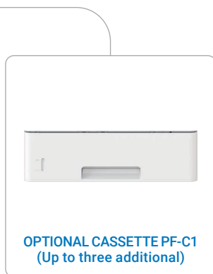
OPTIONAL CASSETTE PF-C1 (Up to three additional)