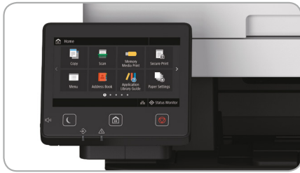
* Printer Screen May Vary.