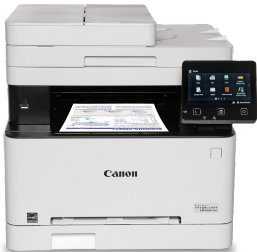
Color imageCLASS MF656Cdw