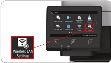
* Printer Screen May Vary.