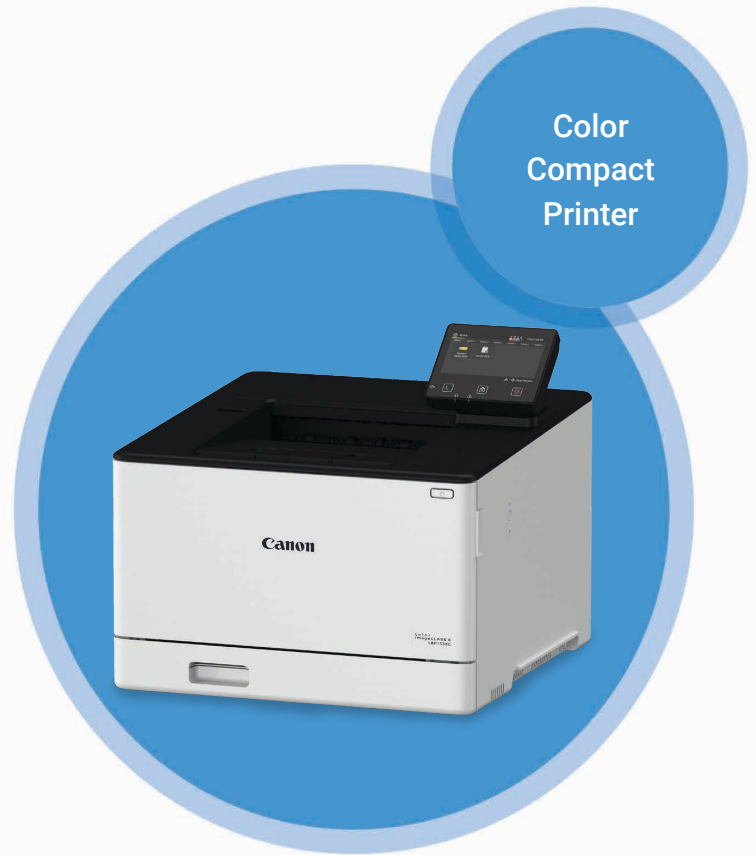
Color Compact Printer

Designed for small workgroups within an office or home environments used as part of an organization's extended print fleet, the Canon Color imageCLASS X LBP1333C printer balances speedy performance, minimal maintenance, and the ability to add an extra paper tray for busy groups. A 5" color touchscreen delivers an intuitive user experience and can be customized by a device administrator to simplify many daily tasks.