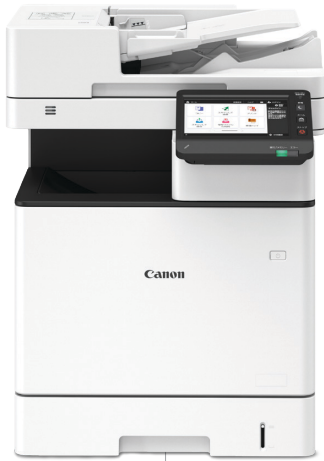
OPTIONAL PAPER FEEDER PF-D1 12