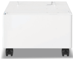
OPTIONAL CABINET TYPE-P