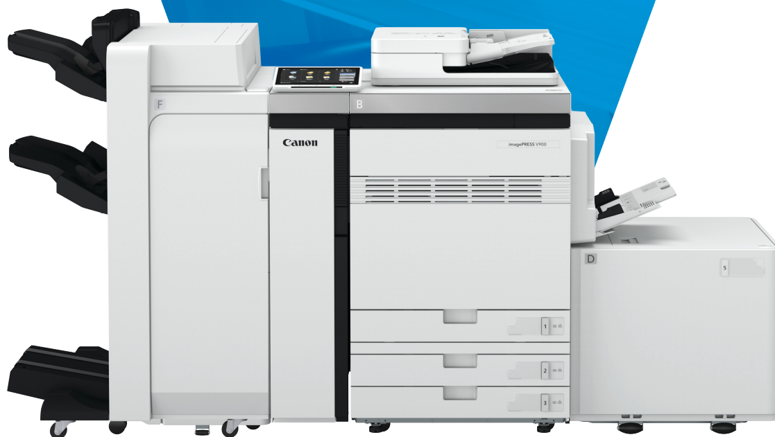
imagePRESS V900 shown with optional accessories.

Support for a Wide Range of Specialty Stocks