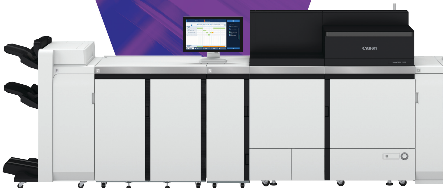
imagePRESS V1350 shown with optional accessories.