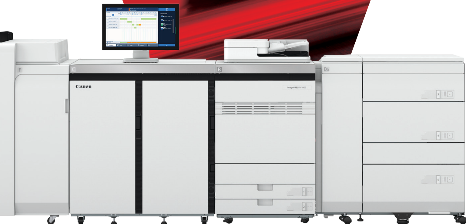
imagePRESS V1000 shown with optional accessories.