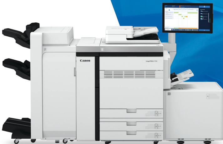
imagePRESS V900 shown with optional accessories.

Support for a Wide Range of Specialty Stocks 5