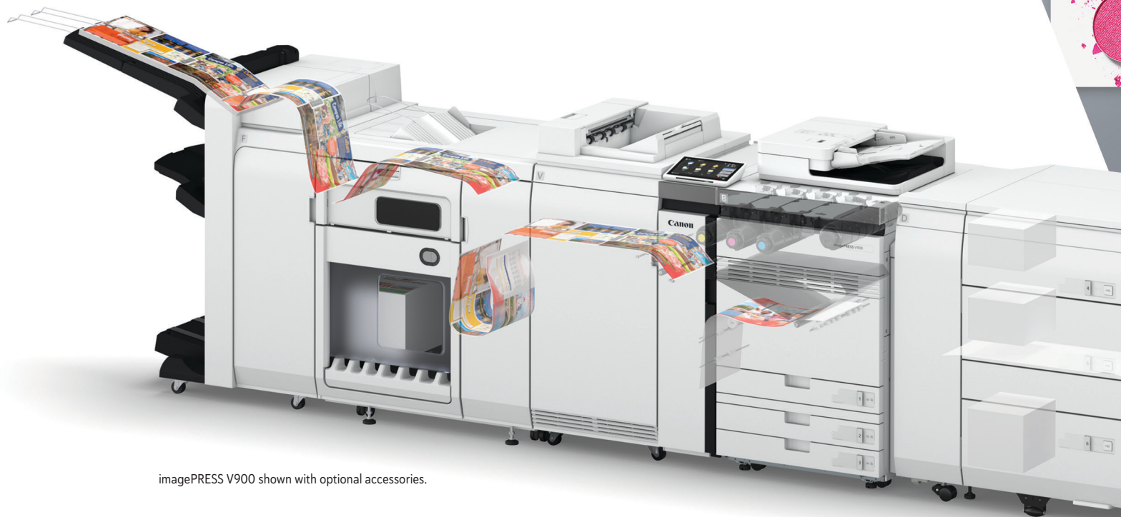
imagePRESS V900 shown with optional accessories.