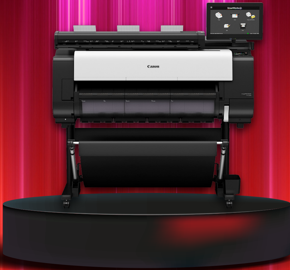
imagePROGRAF TX-3200 MFP Z36