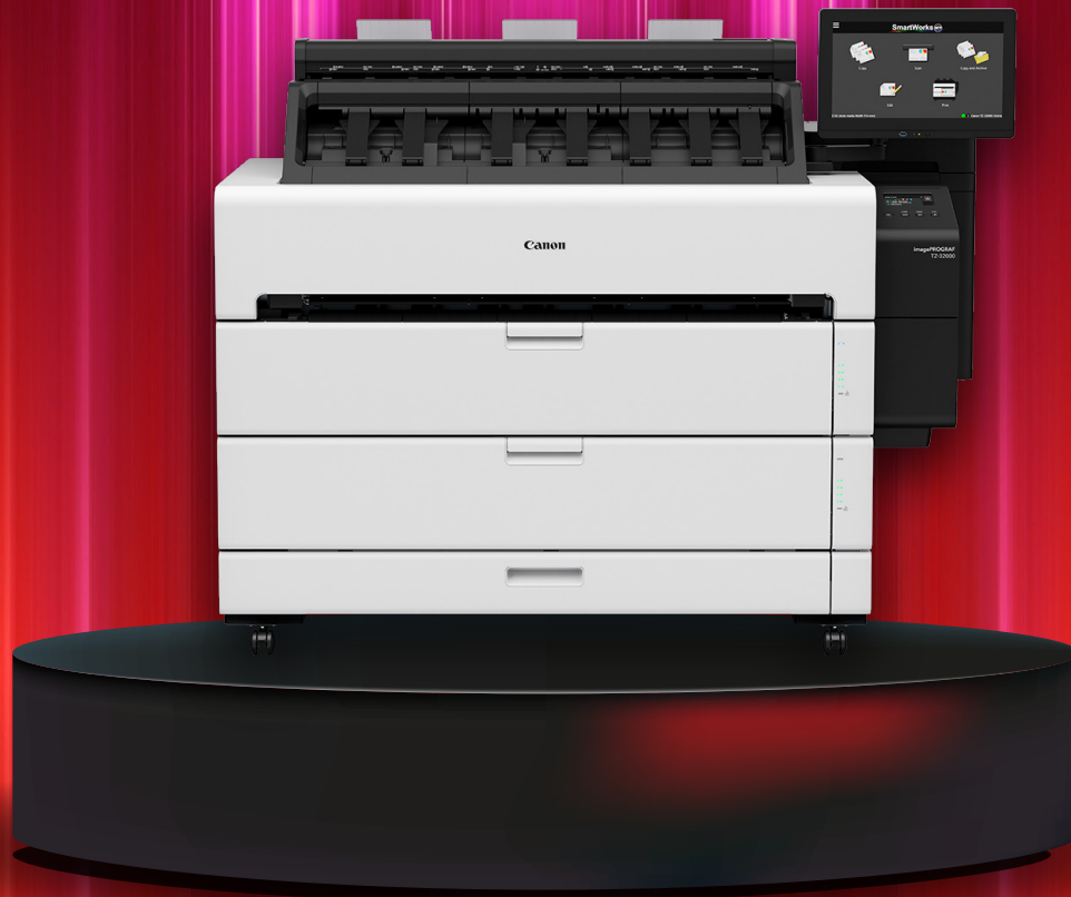
imagePROGRAF TZ-32000 MFP Z36