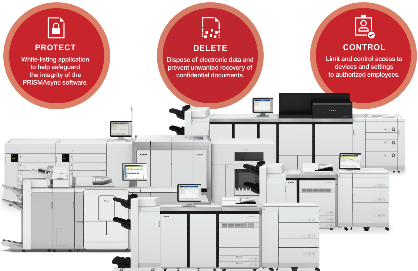
All digital presses shown with optional accessories.