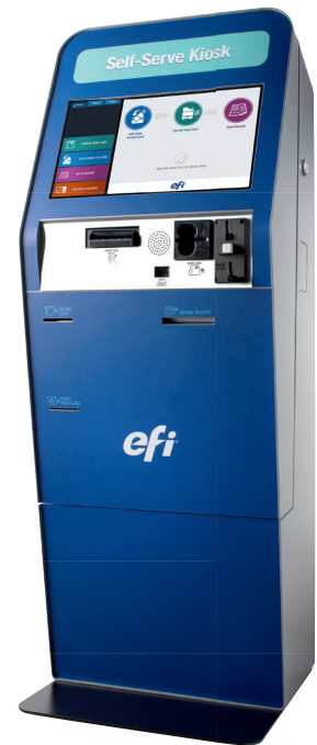
G5 Card Vending Kiosk