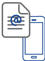
Email print job

After emailing a print job to the device from an authorized email address, the job will appear in the user's secure print queue. Once authenticated, the user sees a single list of print jobs whether they were submitted via email or from their desktop.